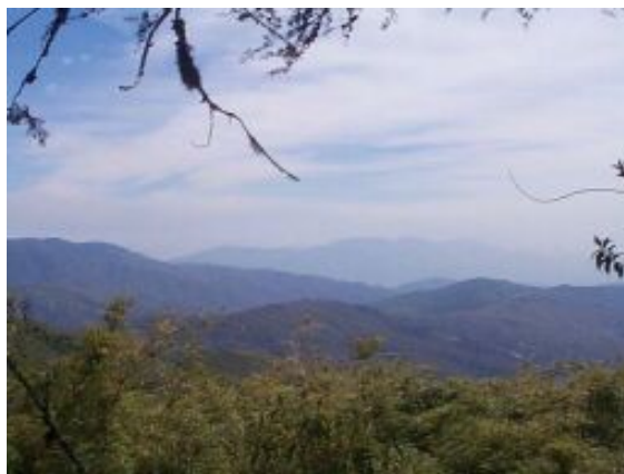
View of National Park Maracao