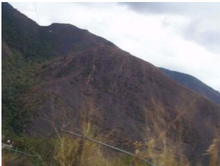
Mountains near El Jarillo in Macarao National Park burned by fire