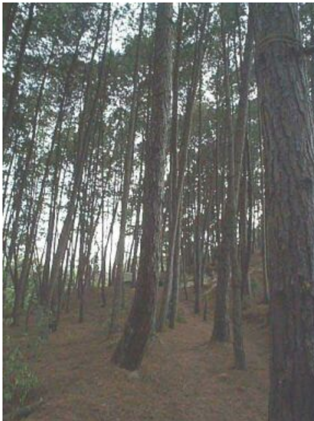
Pine plantation located near La Culebra Ranger Station

1968. Unfortunately, most of these trees were exotic species, primarily pines and eucalyptus. The areas around the park headquarters and the ranger stations are planted with pines; La Culebra Ranger Station is surrounded by two large pine plantations. The ecological consequences have yet to be studied.