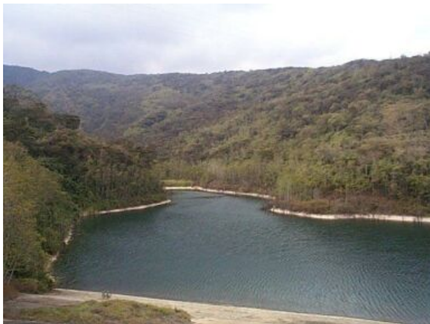
View of Agua Fría Dam in Macarao National Park