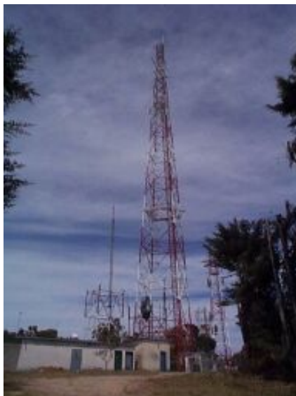
Telecommunication antenna located inside Macarao National Park

managed as if it were on private land. Only the personnel of the companies that own the antennas have access to these areas. One ranger had to ask for a copy of keys from a company security guard in order to gain access to a forest fire, causing an unnecessary delay. This has happened more than once. We visited the area and verified the presence of a 15-year- old EDELCA antenna and two recent antennas belonging to private companies (TELCEL and FOSPUCA). As one ranger told ParksWatch, thefts of electronic equipment are frequent in the antenna area, adding an extra security problem for the park.