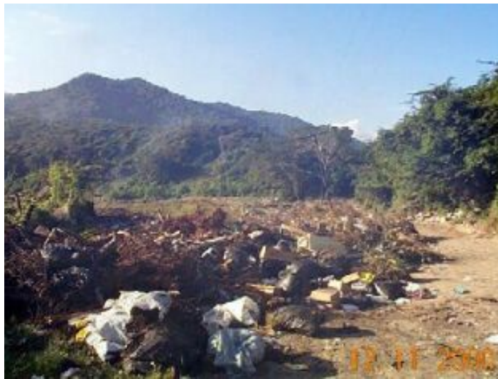
Garbage piles along the northern border of Macarao National Park

The area along the park's northern boundary is a popular tourist destination and experiences a high volume of visitors on weekends. As a result, tourism is the main commercial activity for the people living near El Junquito. Along the road, it is easy to find hostels, restaurants, bars, fruit markets, and hundred of services for weekend visitors who travel to El Junquito or to Colonia Tovar. Several of the attractions for tourists, such as the horse riding trails, are directly affecting the park. INPARQUES allows relatively small areas along the road to be used for riding horses, but INPARQUES authorities have not been monitoring these areas to ensure they are used properly. During our visit, we verified illegal extensions of several riding areas into the park and observed the resulting damage to the vegetation. The high numbers of visitors that visit the areas along the boundaries also generate a large amount of garbage, creating a significant problem.