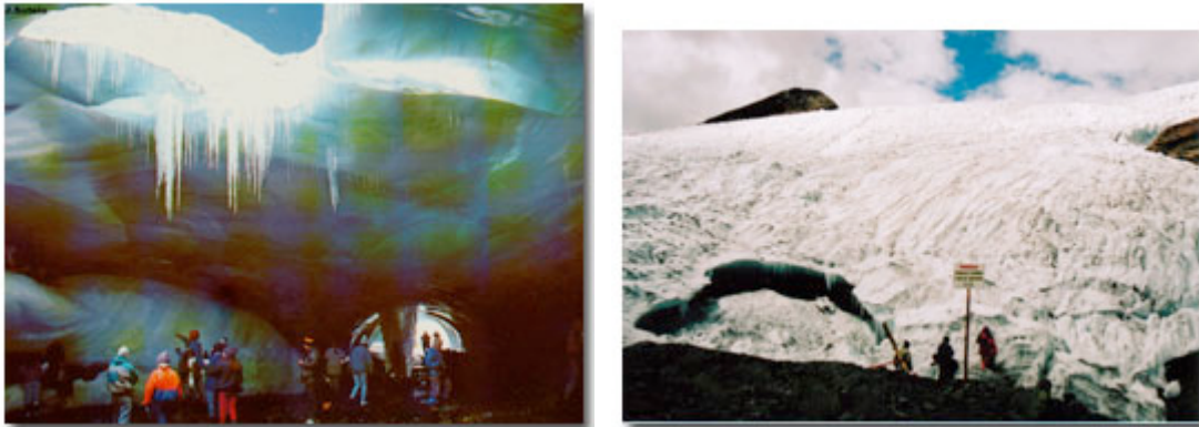
Ice cave in Pastoruri, which has been heavily visited over the years. However, now because of thawing, the cave has disappeared

The expert at INRENA's Glaciology Unit told us that one of the fundamental objectives is to observe glacier behavior. He said, "the first research in Cordillera Blanca began in 1967 and since then, we have monitored the range's glaciers. The results we have obtained are troublesome. Especially starting in 1977, glacier retreat began accelerating. This means that freshwater reserves in solid state stored in these glaciers are reducing and in the future water scarcity will become a problem.... Mountain communities depend on the water from glaciers. Beginning in May, when water levels are low, until September, the water regime (river flows) depends on glacial melting. It is also the time of year when most problems will be felt. Don't forget that in the department of Ancash, water from Cordillera Blanca is used for human consumption and in agriculture, hydro power, mining, agro-industry like Chavimochic and Chincas, and for irrigation of Chimbote and Casma. And for tourism, the lagoons and glaciers are major attractions as one might expect. Based on the rate of glacier retreat, these glaciers will disappear over a relatively short period of time, geologically speaking, and these tourism activities will be seriously affected." 89