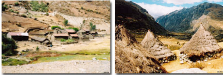
Tambillos Community located within the protected area and herders houses

According to the 1990 Master Plan, there were approximately 74 families (about 350 people) settled within the park at that time, on Cordillera Blanca's western and eastern slopes. Today, the majority of these people live in extreme poverty. Their economy is stagnant and production and traditional use methods are considered rudimentary at best. Production is subsistence and deficient and keeps them in poverty. According to the 1990 Master Plan, park inhabitants live in 7 population centers: Llama Corral and Auquispuquio (25 families – 100 inhabitants), Yuraccorral and Llanganuco (2 families – 8 inhabitants), Juitush (1 family – 6 inhabitants), Rajucola (1 family – 6 inhabitants), Tambillos Ragra cancha (39 families – 195 inhabitants), Pacchacancha, Querococha and Conde Corral (7 families – 34 inhabitants), totaling 349 inhabitants. 40