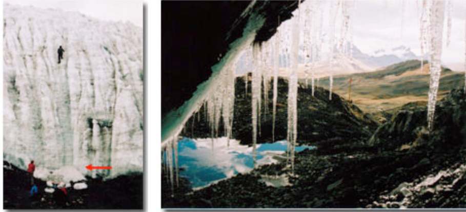
Ice climbing generates breaks and causes parts of the glacier to fall off. The second picture shows signs of glacier retreat