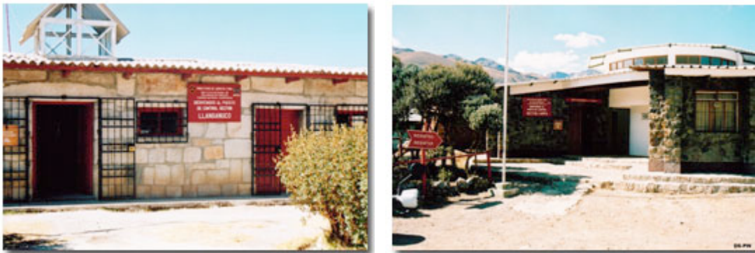
Control posts at Llanganuco and Carpa

The Plan also addresses infrastructure, investments in the park, control posts, maintenance, and vehicle and equipment purchases among others. The park's communication activities include the communication department and their activities to publicize information about the park so that people understand what it is. They are also responsible for facing political debates about the park and addressing any complaints. Another important activity is environmental education, within the public program; it is transversal because there is environmental education for pasture users, conservation committees, loggers, miners, general population, local governments, and many more. There are also activities related to integrating park planning with regional planning processes, and there is coordination with the regional government. We advise them on natural resource information, watershed management, economic management, and also about volunteer park guard activities. 28