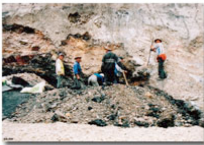
Artisanal mining of carbon in Chavín

Mining activities impact the conservation targets, landscape, water quality, and certain aspects of biological diversity. Among its impacts, mining acidifies water, reduces vegetative coverage, disturbs wildlife (because of noise and miners turned hunters), and its tailings and waste accumulate thereby degrading the landscape quality.