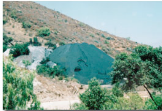
Mining tunnel within the park, and a medium-scale mining operation in the buffer zone

In addition to traditional mining activities, there are also rock and gravel extraction in improvised quarries within the park. These quarries not only generate negative impacts on landscape quality, they affect soil stability and vegetation, generate dust, and introduce heavy machinery. There have been small-scale artisanal extractors who extract rocks for construction purposes or for use in crafts and park administration has been able to effectively control these types of extractors. But, the main player in material extraction from quarries is the Ministry of Transportation, which uses the material for highway maintenance and asphaltting. Its activities seriously affect the park in sectors of operation.