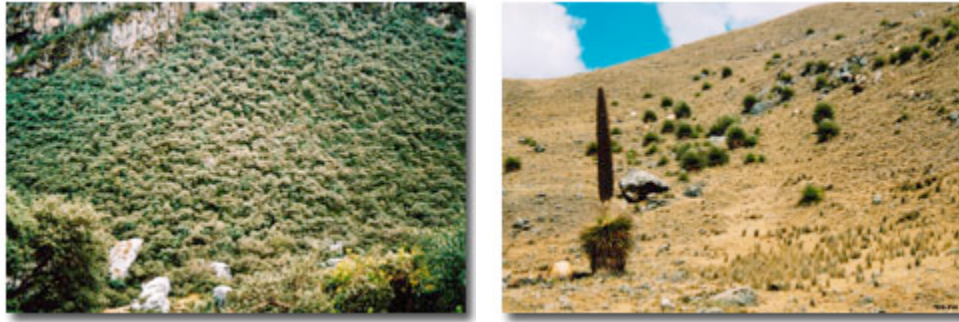
Polylepis relic forest in Llaca Sector and Puya Raimondi in Pastoruri Sector

inflorescence in the world. There are also relic forests and numerous gramineae (grass) species that make up the Puna grasslands. 13