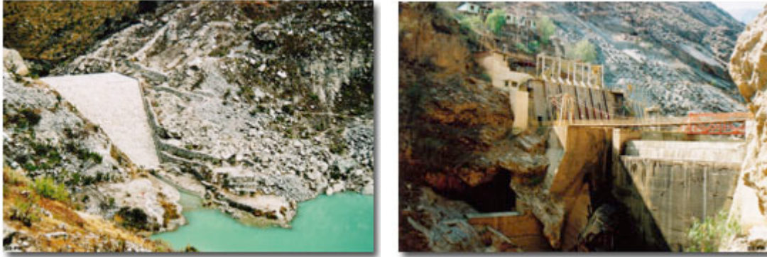
Dammed lagoon (Llaca Lagoon) and the hydroelectric center in Cañón del Pato.

Actually, Egenor operates Parón and Cullicocha Lagoons. Parón Lagoon has been seriously affected by the reduction of water surface area. Parón Lagoon was an important tourist destination, but it has lost its appeal because its water levels are controlled. Inappropriate management of the lagoon's water resources has reduced its value as a tourist attraction. Egenor has a portfolio of projects that also includes securing the Santa River for Cañón del Pato Hydroelectric Center, and damming Querococha, Aguascocha, Qesquecocha, Collotacocha, Shallap, Rajucolta (aka Tambillo), Yuracocha, Paccharuri and Macar lagoons. There is also a possibility of regulating 35 lagoons that were consolidated for security. The Glaciology Unit's project portfolio includes securing four lagoons: Safuna Alta, Artison, Arhuaycocha and Cancaracá Grande (Chacas). 80