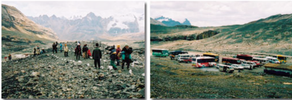
Tourist groups climbing Pastoruri and the concentration of transportation

The first year for which records on tourist numbers were kept was 1987, and that is considered to be the park's baseline data on tourism. In 1987, a total of 62,536 national and 6,000 international tourists passed through Llanganuco and Carpa control posts, which are the park's main entrances. Thirteen years later in 2000, there were 95,446 national visitors and 13,617 international visitors. That represents a 52.63% and 129.95% increase, respectively. 44