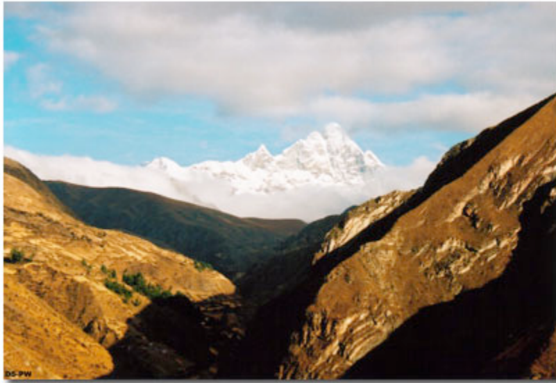
Mount Huantsán seen from Wacheqsa valley in Chavín.

inaccessible zone, there will be conflicts. Work should begin with capitalizing on the park's potentials and determining how to work with local people." 110