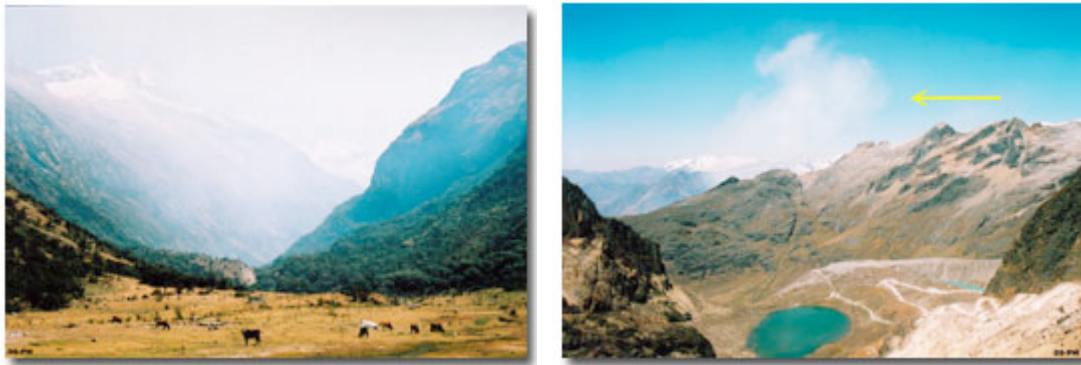
A cloud of smoke is formed by burns, and it can travel great distances affecting the glaciers