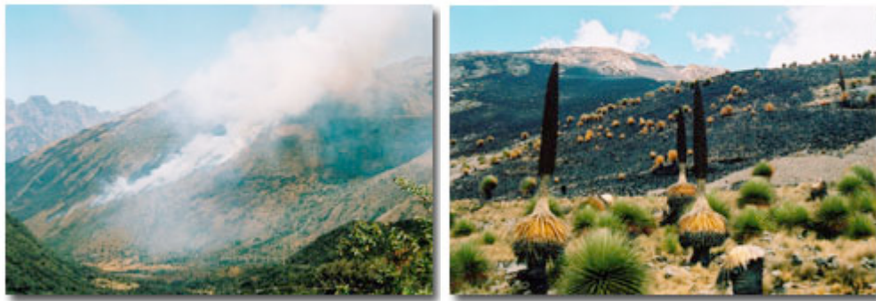
Burning in Potaca Sector, and burning of Puyas Raimondi in Pastoruri sector

Burns greatly impact the park's vegetation and biodiversity. The mayor of Chacas comments that everyone burns their farm plots and because farmers are careless, the fires easily spread to native pastures because during the burn season, pastures are very dry and it only takes a small amount of wind to generate out of control wildfires. He said, "This damaging tradition continues and is a real problem today." 54