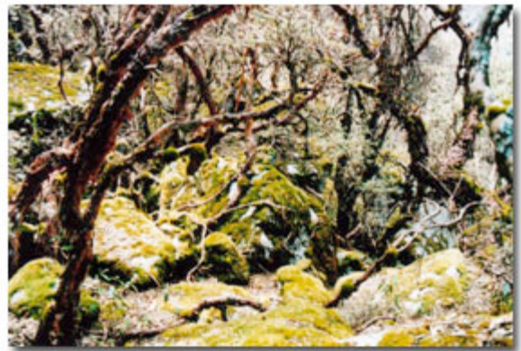
Forest found in Llaca Ravine

This ecosystem has a super-humid and cold climate. Its average annual precipitation varies between 1,000 and 2,000 mm and annual average temperatures oscillate between 6°C and 3°C. It covers approximately 48,620 hectares, corresponding to 14.3% of total park area. As with the other habitats, it is within the tropical latitudinal region and is located in the southeastern sector of the park and covers the provinces of Asunción and Bolognesi, at about 3,800 m altitude.