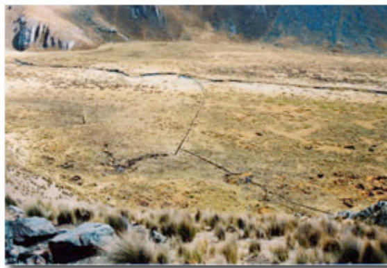
Irrigation canals are clearly visible in this photo

In the sector of Pastoruri, irrigation canals have been built to “improve” pastures for livestock. Locals state that support for the canals was secured from PRONAMACHS (the National Program for Watershed and Soil Management, Programa Nacional de Manejo de Cuencas Hidrográficas y Suelos ), which was an institution during the previous national administration. There are approximately 20 families settled in this sector, all dedicated to raising cattle, sheep, and horses.