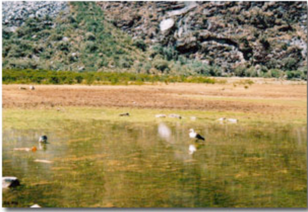
Wild ducks in Llanganuco Sector

Avifauna appears relatively healthy in most ravines and valleys. However, their absence in some evaluated ravines indicates that part of the structure on which they rely, especially forests and matorrales, is absent. More complex ravines, with greater habitat variety, harbor greater avian diversity regarding the total number of species. A longer evaluation would probably encounter more species per ravine, but it is unlikely that the number of typical forest species would increase much. 16