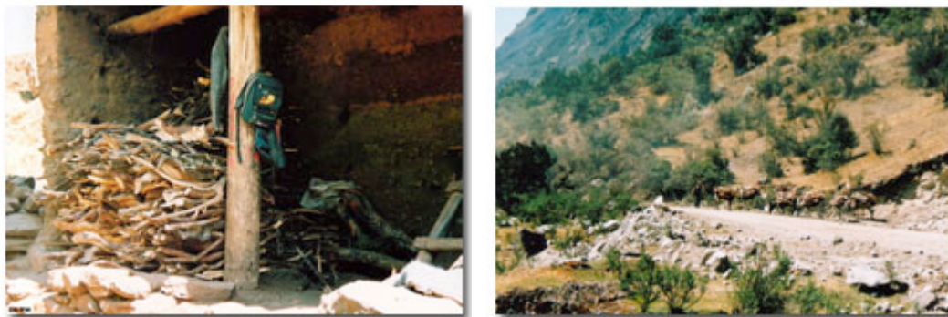
Locals within the park rely on firewood for fuel and use donkeys to haul firewood for sale

The Master Plan identifies 74 places where pastures are frequently burned, 58 locations where forests are indiscriminately logged, 53 places where lands have been opened up for farming activities, 10 places with vegetative coverage loss, and 19 locations with a human settlement of 5 or more families. 56 The most frequently burned areas are in Ulta and Parón Valleys. In Ulta, pastures in the valley and the upper parts are burned and these burns impede polylepis forest regeneration and extension. 57