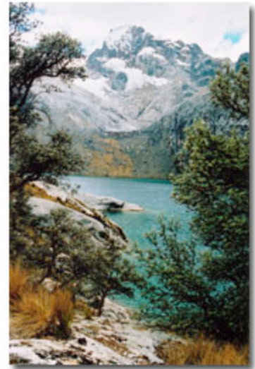
Vista Laguna Churup

The general concept of a biosphere was developed in 1974. Biosphere reserves are terrestrial and coastal/marine ecosystems, internationally recognized under the Man and the Biosphere Program. Three primary, complimentary functions are assigned to such reserves: a conservation function to protect genetic resources, species, ecosystems, and landscapes; a development function to promote sustainable human development; and a logistic function to support and encourage research activities, education, and permanent monitoring related with local, national and international conservation and sustainable development activities. 21 Huascarán Biosphere Reserve's borders extend beyond the park and its buffer zone to incorporate the left bank of Santa River and the right side of Callejón de Conchucos, which includes several towns and rural settlements.