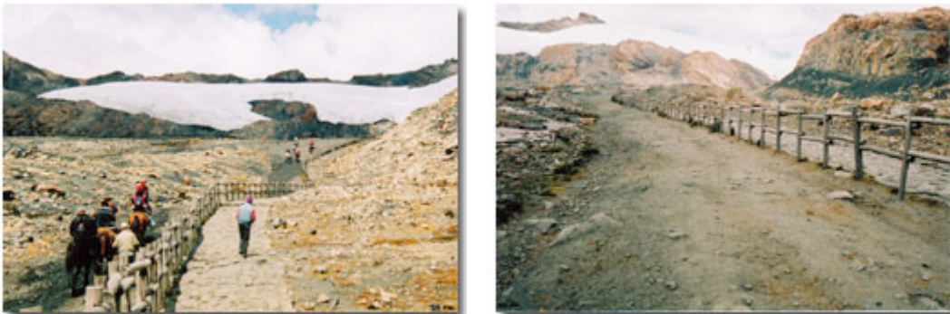
This photo shows tourists going up to Pastoruri on horse and the other shows soil erosion from all the horse and hiker traffic

In addition to charging entrance fees, the community of Catac charge for other services like horse rentals, vehicle parking, and guiding tourists to the foot of the glacier. Most tourists use these services because of the effects from the high altitude. The horse trail is parallel to the hiking trail and is severely eroded and generates large amounts of dust that affects hikers along the cobblestone-hiking path. The community also sells food, has a lodge, crafts and rents boots. And, despite the fact that the Catac community is responsible for maintaining the area, waste and garbage is often littered about, especially plastic bags.