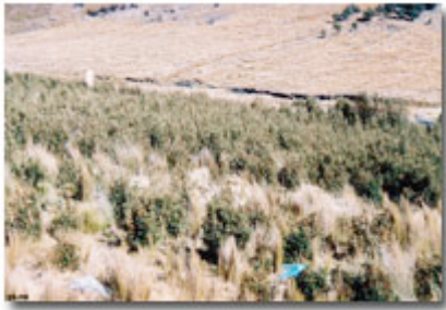
Reforestation in Querococha sector

Vegetation removal and burning must be strictly prohibited in Huascarán National Park. Controlling burns must be improved and intensified urgently. Awareness must be raised and therefore propaganda and information dissemination are needed. All media sources should be used: radio (for the rural areas), newspaper, and local television in urban areas around the protected area in an effort to stop burns and wildfires. In farmed and eroded areas within the park, soil restoration should be initiated.