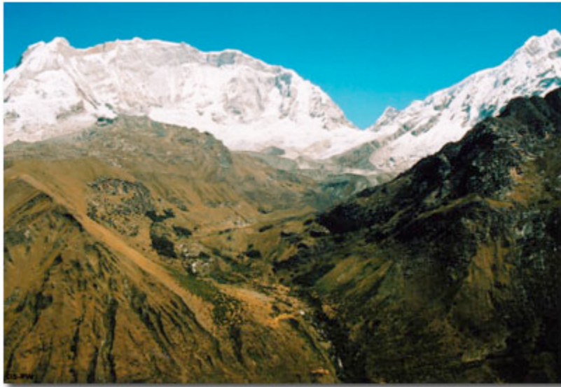
Mount Huascarán is located in the southern portion of the park and is the tallest peak