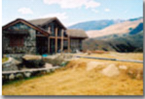
This photo demonstrates proper management of tourist infrastructure

local communities. “Tourism depending on mountaineering lasts 4 months out of the year. This is the problem, because in more than 15 years of mountaineering, there are no other alternatives. We should have kayaking and canoeing, make mountain biking routes—cycling opportunities here are incredible—, and establish paragliding courses among others. If this works, we will have tourists 9 months out of the year and that means income for the park. Additional infrastructure would be needed and publicity, actually infrastructure takes precedence to everything else.” 100