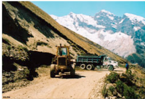
Views of areas within the park where material for highway maintenance and asphaltting are extracted