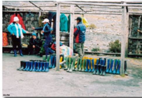
Horse rentals in Pastoruri and a boot-rental shop to walk along the ice in Pastoruri.

Llanganuco valley and Pastoruri Mountain are the most important destinations and concentrations of tourists during the high season surpass the ecosystems' carrying capacity and have a large impact. Main problems include visitor and vehicle congestion, erosion and soil compaction, organic and solid waste generation, water contamination (in the lagoon and glacier), soil contamination, and air pollution because of vehicle emissions. As well, vehicles and visitors generate noise pollution. 67