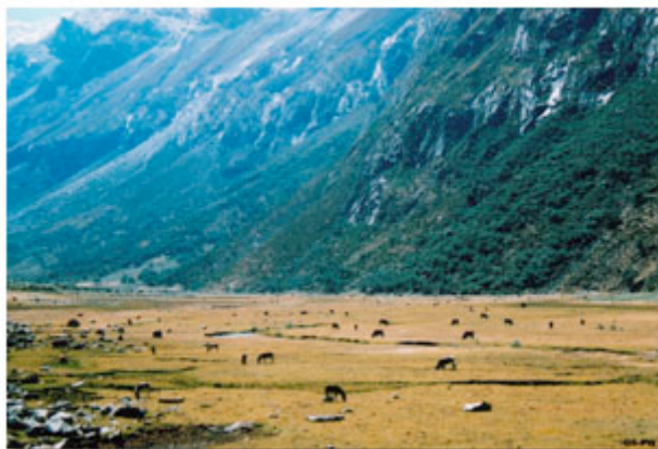
Cattle grazing in Ulta Valley

The socioeconomic sector involved in raising and managing cattle and sheep within the park is extremely poor, marginalized, and lack access to the advantages of modern life. Their marginalization has deteriorated their quality of life dramatically, influencing their livestock production in everyway. Add to this inadequate transfer of technology and insufficient technical assistance, which have caused livestock production to fall to subsistence levels at best.