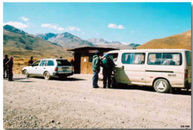
Catac community members charging tourists to enter the sector

Another problem in tourist sectors are vendors and peddlers. During an interview, the director of the mountaineering school explains what has happened in Huaraz. He said, "since I was a boy, I would go to the mountains. I would come across rural farmers checking on their animals and only once in awhile would I run into a foreigner. Now, with tourism on the rise in Peru, there are tourist refuges in the park and people who compete with those refuges, such as street vendors and peddlers. Two years ago, I was in Ishinka and there were a couple of young teens from Huaraz selling sandwiches and soda pop. Apparently, someone had told them that the established lodge in the area had expensive food, so they decided to come an offer cheap food at Ishinka base camp. I was surprised and told them that the park guards were going to show up and remove them from the area. Well, the next week, the teens were still selling. I have not going to Ishinka this year, but colleagues tell me that three kiosks have been set up. This shows that the park administration is getting weaker and losing more control." 69