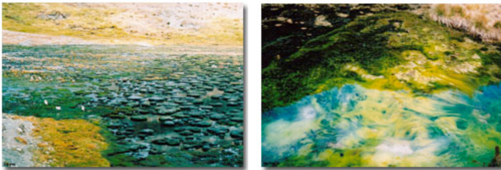
High Andean wetlands in Pastoruri Sector and Aquatic vegetation in Churup

This vegetation type appears much like a swamp, but its dominant plants tend to form large and extensive mats. Characteristic species include Oreobolus obtusangulatus , Distihica muscoides , Calamagrostis chrysantha , Senecio sp., and Castilleja sp.