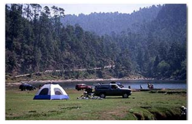
This is one of the lagoons where tourists visit on the weekends.

Lagunas de Zempoala also receives a considerable influx of visitors primarily on the weekends. Inhabitants of Mexico City, people from Cuernavaca, and the state of Mexico visit the protected area to rest in its forests and lagoons. The Chichinautzin Biological Corridor has less infrastructure and therefore is used mainly as a means of connecting the two parks.