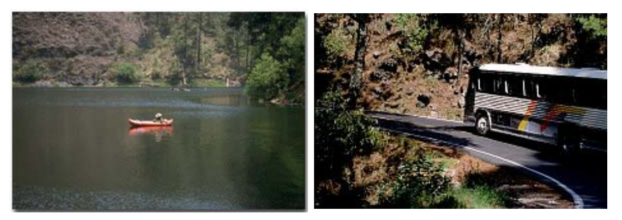
The lagoons are used for fishing and kayaking.

Tourist activity in the protected areas is regional, national, and international, and is best developed in Tepozteco National Park. Visitors use the city of Tepoztlán as a jumping off point because it has infrastructure for medium-scale tourism and offers all the services. In Tepozteco National Park there is an archeological region located in the Sierra de Tepoztlan. The mountains are peculiar in shape and the top of the Tepozteco Hill has a pyrimad in honor of Tepoztecatl, the principal deity of pulque (Martinez 1994). The archeological area is administered by INAH. According to residents and frequent visitors, these mountains are a great source of positive and spiritual energy, which makes the area of site of great interest for national and foreign tourists.