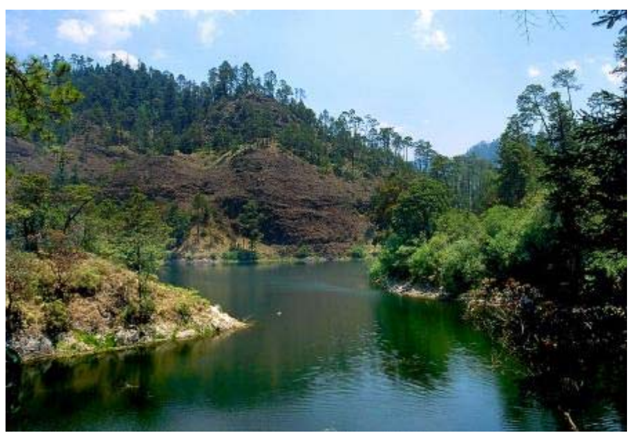
Lagunas Zempoala National Park is connected to El Tepozteco by the biological corridor.

Currently the biological quarter is threatened by changing use of soils, the sale of land, forest fires, poaching, deforestation, and the sale of earth and volcanic rocks. Owing to these things, ParksWatch classifies it as critically threatened. Though the administration of the protected area is working to obtain more human and financial resources, urgent solutions are necessary to ensure the protection and maintenance of the biodiversity. If no immediate action is taken, there is a very high risk that the protected area will fail to maintain its biological diversity in the immediate future.