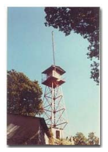
Observation tower to detect forest fires

The corridor's management plan should include a permanent campaign to prevent forest fires. Tourists need to receive information on forest fire prevention, especially for those tourists camping and vacationing. Local farmers also need to be included in the program as they frequently use fire in their farming and livestock activities; fires that sometimes get out of control and affect the protected area. In 1998 after the devastating fires, private companies such as Ford donated equipment to combat the forest fires and promote reforestation in the affected areas. Currently the responsibility for the forest fires falls to the National Forest Commission (CONAF). It is imperative that the reserve's own administration develop forest fire prevention plans.