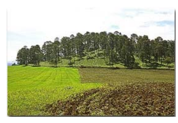
Forest fragmentation is due to be cultivation of forage.

Deforestation resulting from cultivation in the biological corridor.