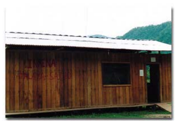
INRENA's forestry control post along the Puerto Ocopa – Satipo road

Personnel of the forestry control post constantly receive threats from loggers. During the night, loggers may block the exit of the control room so that it is impossible for the people inside to stop the loggers' trucks from passing, and generally prevents any enforcement from occurring. These are people to fear, according to the poor people in the area. They come from Tocache and Uchiza, centers of drug production, and are contracted killers that often complete their task. According to sources, the personnel of the control post do not fear these people and are receiving more than enough support from DIRCOTE.