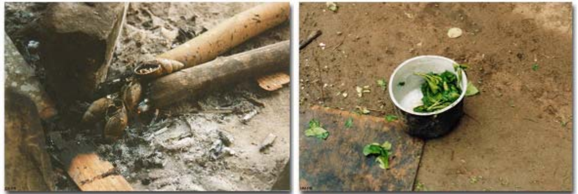
Snails complement the native people's diet. Medicinal plants are used often.

Immigration into adjacent areas, with the consequences of deforestation and environmental degradation, means that many species of fauna flee from the pressure, seeking refuge in less accessible areas within the reserve. Hunting, fishing, and harvest activities do not currently threaten Asháninka Communal Reserve. Nevertheless, an increase in the number of settlers in the region because of colonization will increase the demand for forest products, resulting in more pressure on the same, which will affect the communal reserve.