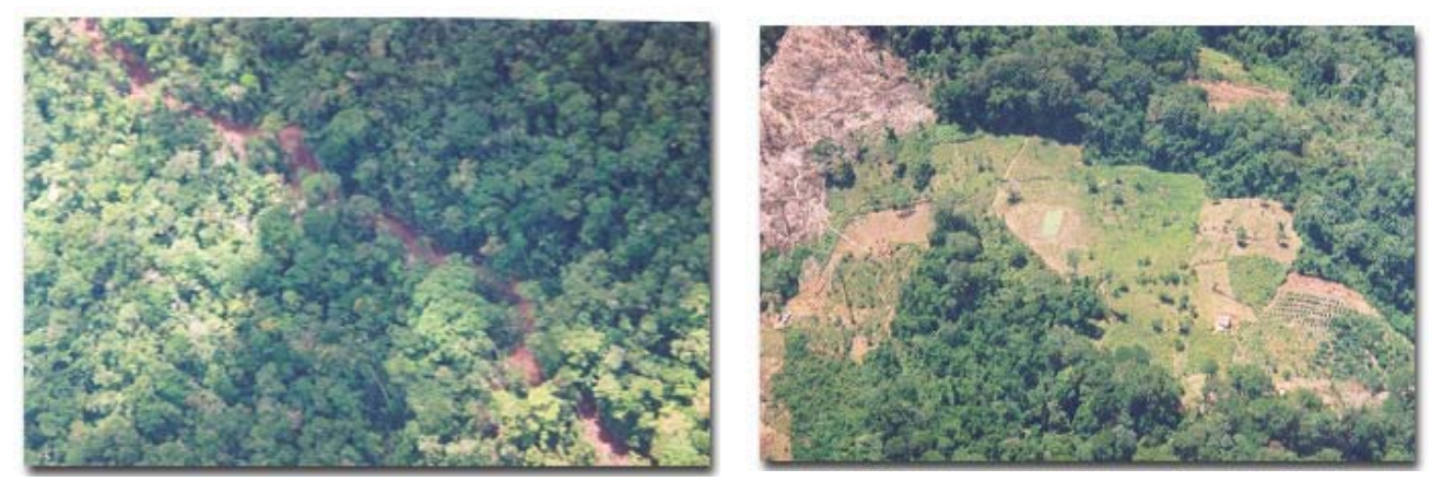
Forestry roads facilitate access for colonists who later deforest large expanses in the region, photos © ACPC.

It is absolutely necessary to monitor the existing access roads and the routes under construction, those from Satipo toward Atalaya, Pangoa toward the Ene river, that come from Apurimac and the forest roads. Authorization of roads should be impeded. The immigration and migrant settlement via these routes should not be permitted. At the same time, an investigation of the real construction situation within the protected area should be carried out and its advance should be stopped. Strict supervision must be exercised on the lumber companies that operate toward the north of the protected area and they should be prevented from the continued opening of the area around this highway.