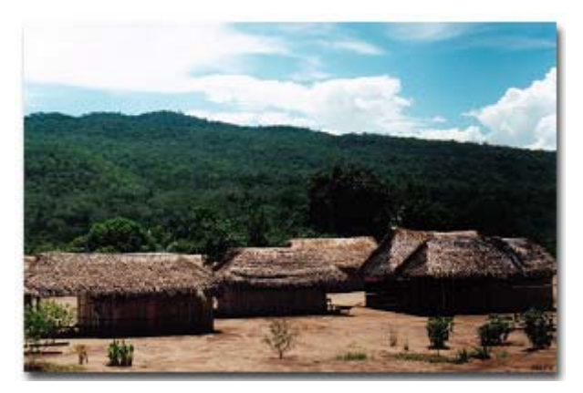
Meteni Native Community, photo © Diego Shoobridge, ParksWatch – Peru

There are approximately 36 native communities, of the Arahuaca linguistic family, Asháninka ethnicity, living in the Tambo and Ene River Basins. Total population is approximately 10,000. Communities adjacent to the reserve have the most access to it. In Tambo's Valley, adjacent communities include Tsoroja, Anapate, Otica, Coriteni Tarso, Oviri, and Cheni. Tambo River's population is approximately 3,000 people, with a tendency to increase since population growth in the zone continues. Poyeni is the most populated native community in the Tambo Basin with 1,200 people (200 families). They are distributed in the main town of Poyeni and its annexes: Savareni, Selva Verde and Corinti. None of the other native communities in Tambo Valley have