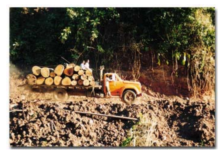
Timber systematically extracted in the area is transported along the Puerto Ocopa – Satipo road

Loggers are taking wood primarily from native communities. They make agreements that are often fraudulent or disadvantageous for the local community. The community puts up the title to their land to obtain permission to log it; meanwhile the loggers receive the benefit without risking anything. According to an interview with a civil employee, for every mobilization, or cutting event, the natives receive about $3 U.S. dollars, while the loggers are becoming millionaires. The natives are being swindled without ever realizing it.