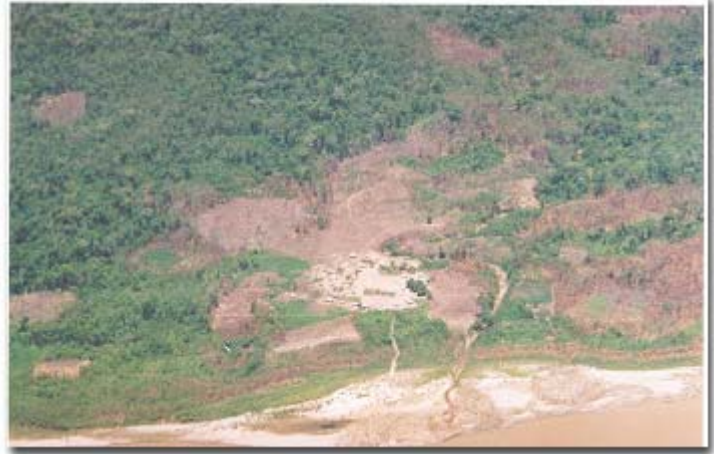
Deforestation due to human presence

The arrival of Andean colonists and terrorists from the Sendero Luminoso group generated structural changes in both density and distribution of the Asháninka living in the Ene River Valley. There used to be more than 20,000 Asháninkas spread throughout the region. Many of them left their traditional homes and retreated further into the forest to escape the Quechau colonists' invasion; they were moving in from the north, west and south. A census revealed that the area around the Cutivireni Mission used to Asháninka population center.<sup>28</sup>