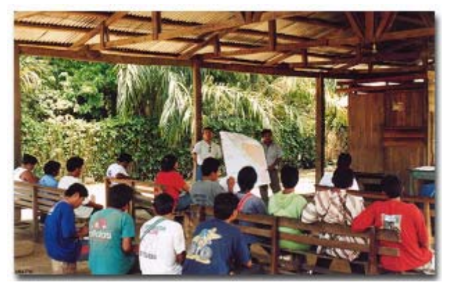
ACPC Workshop regarding land titling.

When the technical documents were presented, as part of the process to create the