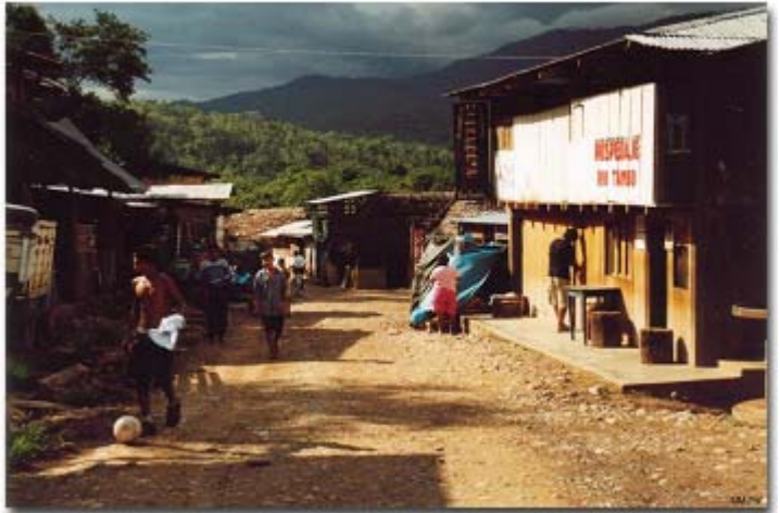
colonisis, pnoto 🛛 Diego Snoobriage, Parkswatch – Peru

ACPC is involved in a thorny process because they are trying to stop waves of new colonists from colonizing the area. This has presented some negative repercussions for ACPC, especially in their work in Satipo, a city dominated by colonists, where they have had problems with their image and where the public perceives them negatively. In spite of that, ACPC has embraced the task of defending the indigenous territories. Lamentably, the presence of so many colonists is one of the biggest threats not only to the indigenous population, but