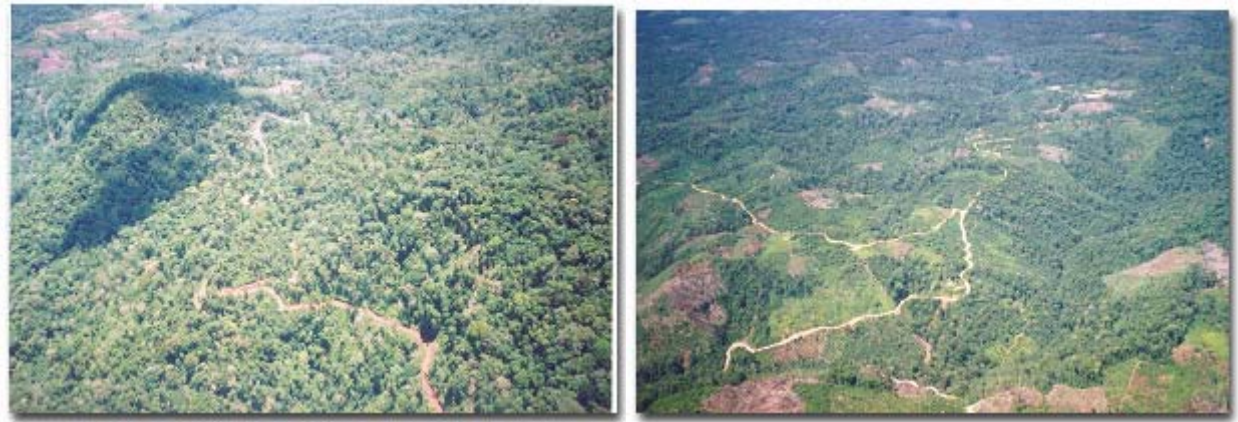
Highways facilitate colonists' arrivals and they generate a vicious deforestation cycle, photos © ACPC.

The same things are occurring in regards to the extraction of wood from the territories of the native communities. Many native leaders support the construction of access and forestry roads, in complicity with businesses and lumber extractors, for whom they are signing documents behind the backs of the communities. As the president of Cutivireni declared, there is a lack of knowledge in general on the part of the native communities with respect to the danger of the highways; they only know their larger characteristics. Unfortunately the president of the Central Asháninka of the River Ene (CARE) has signed agreements without his community knowing. On the one hand these are a favor to the lumber industry, on the other they are motivated perhaps with a political end in mind; as election campaigns approach he will be seeking more prominence and support from colonists.