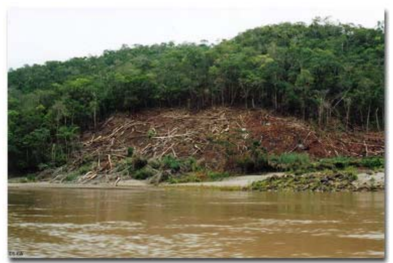
Migrant colonists deforest the area

New farmers settlements in the region should be regulated; favor should be given to the farmers who agree to develop non-traditional activities such as apiculture, management of ornamental plants, tourism, implementation of agro-forestry systems, and other compatible activities with the area. Reducing the use of the lands within the region should be carried out according to the greater capacity of permissible use, that is to say, if lands are apt for protection or for forest management, to dedicate them to that corresponding use.